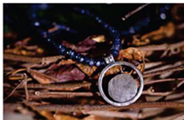
N032 available in lab or iolite